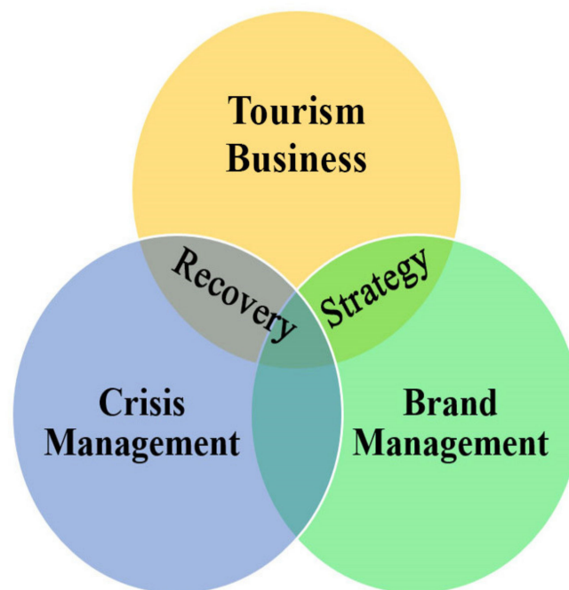
Figure 1. The conceptual model.

Figure 1 depicts our proposed approach, which is guided by brand management and crisis management theories. The rest of the section covers literature around these key theories. Section 2.1 discusses the impacts of crisis and recovery strategies on tourism businesses; Section 2.2 explores crisis management, and Section 2.3 presents the role of brand management during the crisis.